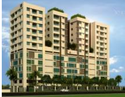
RWD Atlantis, Nelson Manickam Road