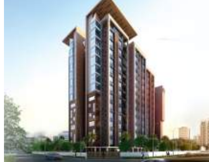
RWD Corniche, Egmore