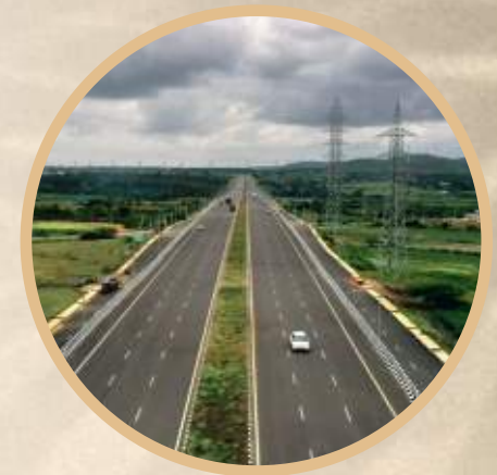
NATIONAL HIGHWAY 716