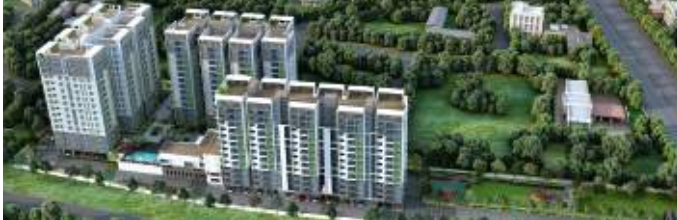
RWD Grand Corridor