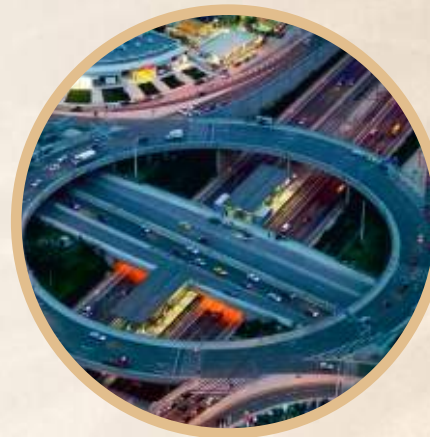
MADHAVARAM RING ROAD