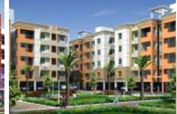
RWD Elysium, Kelambakkam