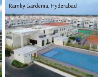
Ramky Gardenia, Hyderabad