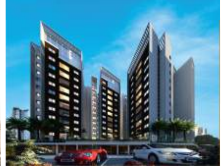
RWD Lemongraz, Ambattur