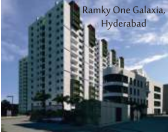
Ramky One Galaxia, Hyderabad