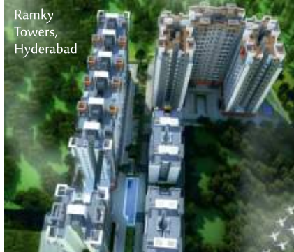
Ramky Towers, Hyderabad