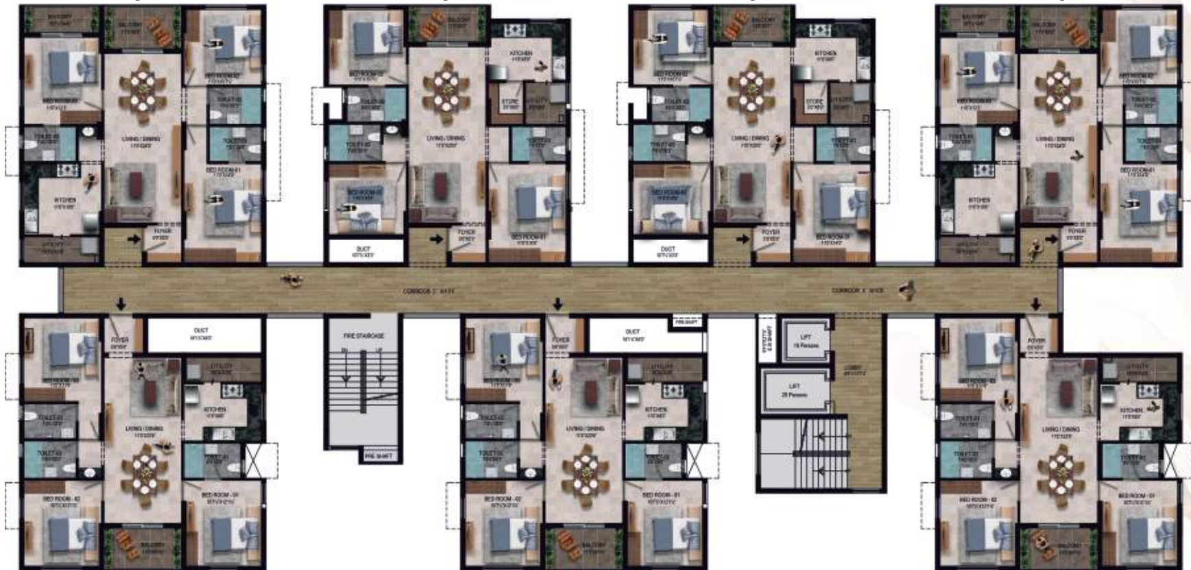
3 BHK - 1568 SQ.FT. Apt No - 102 to 1302