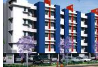
RWD Fern, Medavakkam