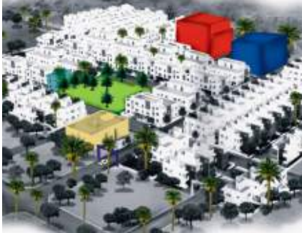
RWD Palm, Medavakkam