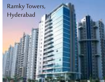
Ramky Towers, Hyderabad