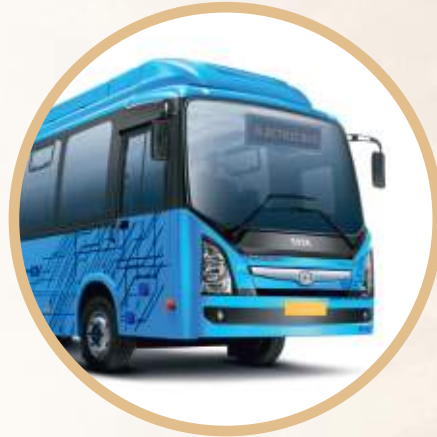
MADHAVARAM MOFUSSIL BUS TERMINUS (MMBT)