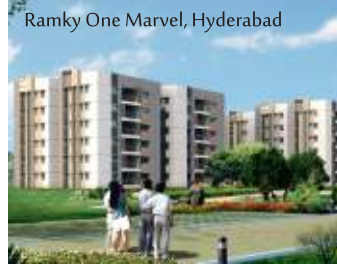
Ramky One Marvel, Hyderabad