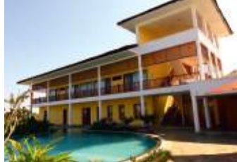
RWD Ecopolis, Vedanthangal